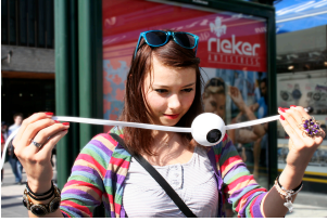
Figure 2: Playing with the BodyBug