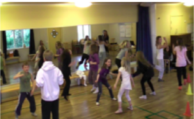
Figure 4: Workshop Games. From top to bottom: “The Bomb” (younger children); “The Mirror” with the BodyBug and beats (older children); “The Mirror” with music and without the BodyBug (younger children).

Older children focused more on cooperation and collaboration among the group. The music in “The Mirror” was very fast (i.e. “Bad Romance” by Lady Gaga) and difficult for ‘the image’ to mimic accurately. Therefore collaborative tricks were common among this group, such as ‘the generator’ often repeating short sequences of movements, until ‘the image’ managed to repeat that sequence; or ‘the generator’ using a slower pace when initiating a new movement, and then speeding it up once ‘the image’ was able to perform that movement.